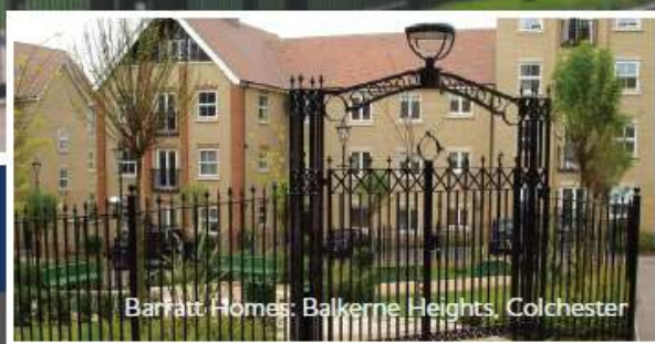
Barratt Homes: Balkerne Heights, Colchester