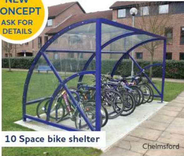
10 Space bike shelter