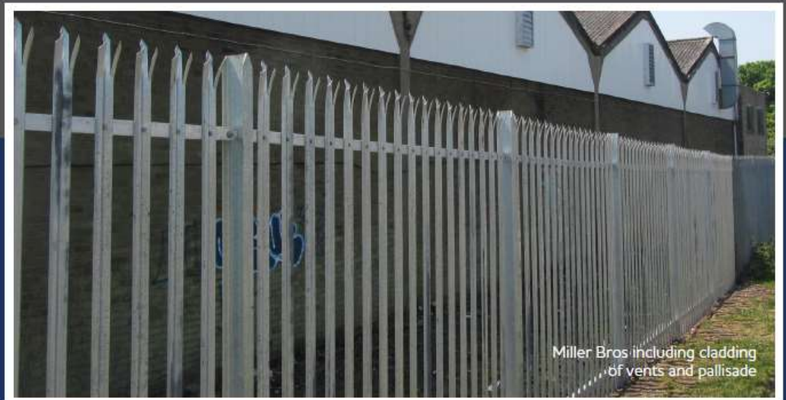
Miller Bros including cladding of vents and palisade

We also offer a wide range of ornamental railing. Manufactured by our in house skilled craftsmen who can offer an almost endless choice of different designs and variations to suit your individual needs.