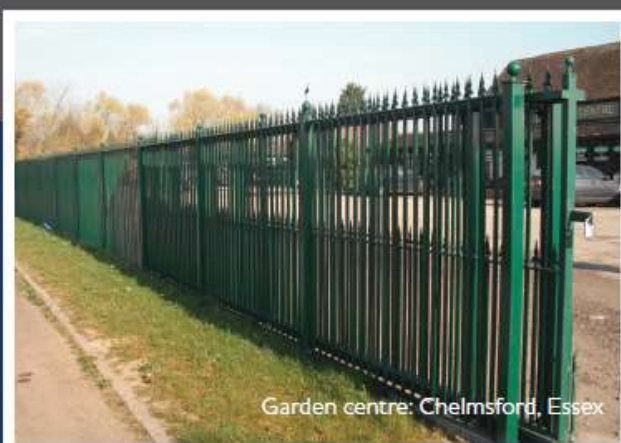
Garden centre: Chelmsford, Essex