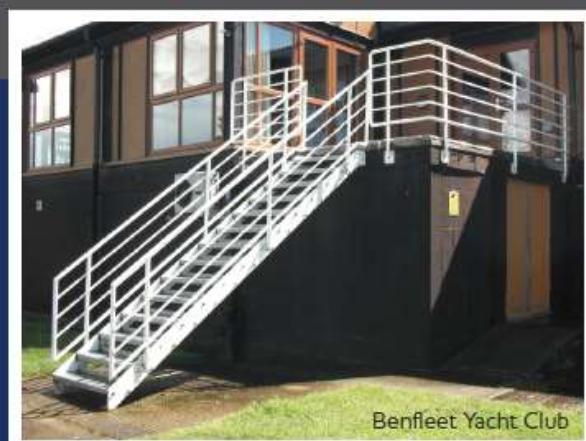
Benfleet Yacht Club

With options to suit all budgets our experienced sales department is on hand to offer advice and support for all of your fire escape stair requirements.