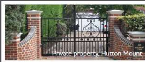
Private property, Hutton Mount