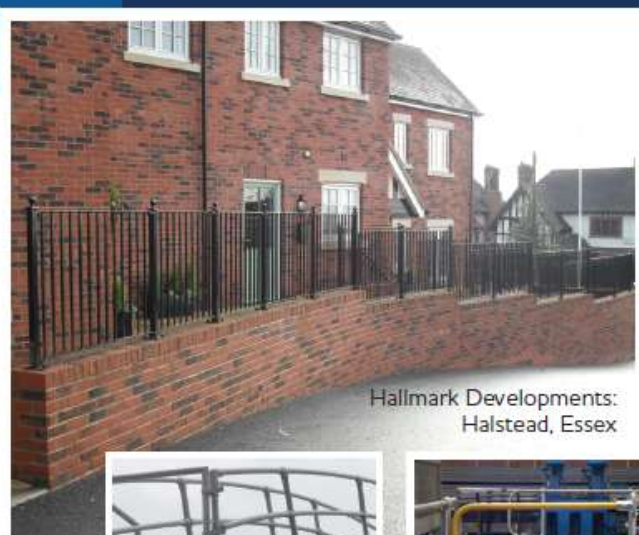
Hallmark Developments: Halstead, Essex