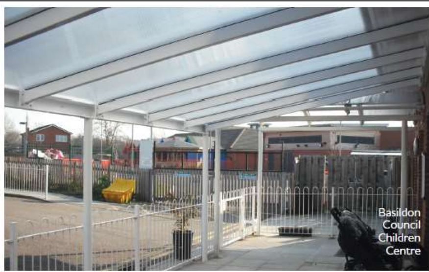
Basildon Council Children Centre

At R&J Fabrications we fabricate, supply and install all types of shelters from basic canopies to walkways. Our Canopies and Walkways are designed and fabricated to your bespoke required needs.