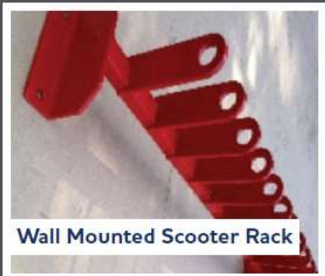
Wall Mounted Scooter Rack

Installation service provided if required please call for details