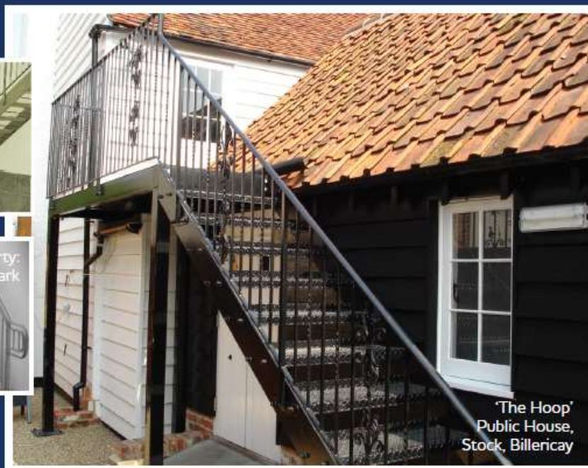
'The Hoop' Public House, Stock, Billericay

R&J manufacture and install a large range of metal staircases from our factory in Billericay. Our designs range from balcony/landing staircases, internal and external ornamental designs to include spiral staircases. Fire escape stair cases are essential for safety and to meet building regulations. Your fire escape stair case does not need to distract from the overall aesthetics of your building by design of tread, balustrading and hand rail finishes. With our vast variety of designs we can help pick your exact requirements.