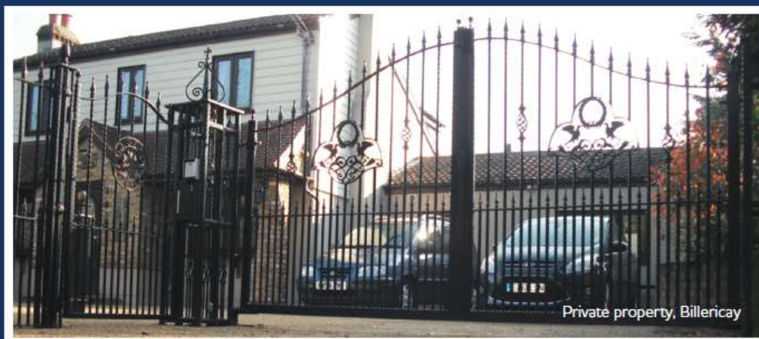
Private property, Billericay

We offer a wide range of bespoke ornamental gates, from Double/Single Swing Gates, Sliding Gates, Cantilever Gates and Pedestrian Gates, all with matching Railings to complement their designs. Our skilled craftsmen can offer an almost endless choice of different designs and variations to meet your individual needs. By incorporating the use of classic ornamentation including hand forged scroll work, finials and spikes, in addition to cast iron and drop forged finials.