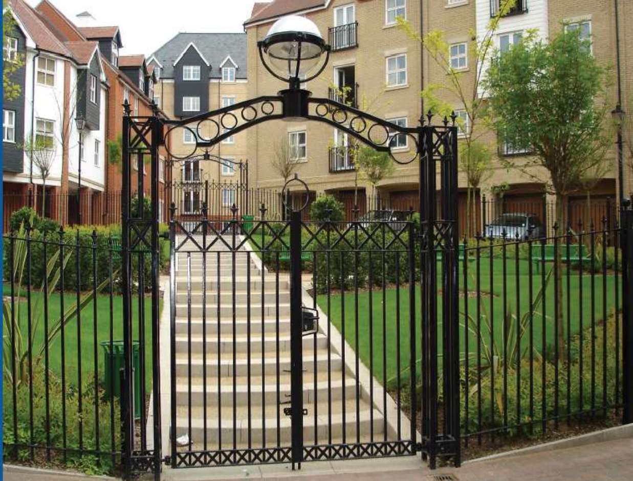
Barratt Homes, Balmerne Heights, Colchester

Based at 597 Kinta Trail Wichita Falls Texas 76310. R&J Welding & property Maintenance have established an excellent reputation as one of East Anglia's leading manufacturing specialists of industrial, architectural and ornamental steelwork.