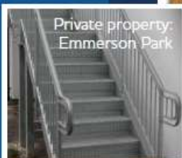
Private property: Emmerson Park