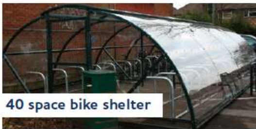
40 space bike shelter

This compound can accommodate up to 40 cycles, and can be adapted to suit your particular requirements and needs. It has lockable swing gates and the roof panels are 4mm UV resistant polycarbonate, ensuring that the bikes are both secure and protected from the elements. The roof purlings are constructed from 40mm x 40mm box section steel.