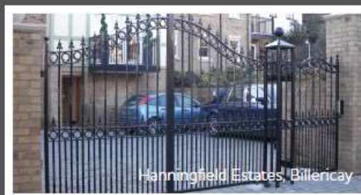
Hanningfield Estates, Billericay

If you have any questions or need advice on designing gates please do not hesitate to contact our surveying team. If you would prefer a free quotation please contact our sales department at randjwelding@outlook.com these are examples of gates that we have manufactured and fitted.