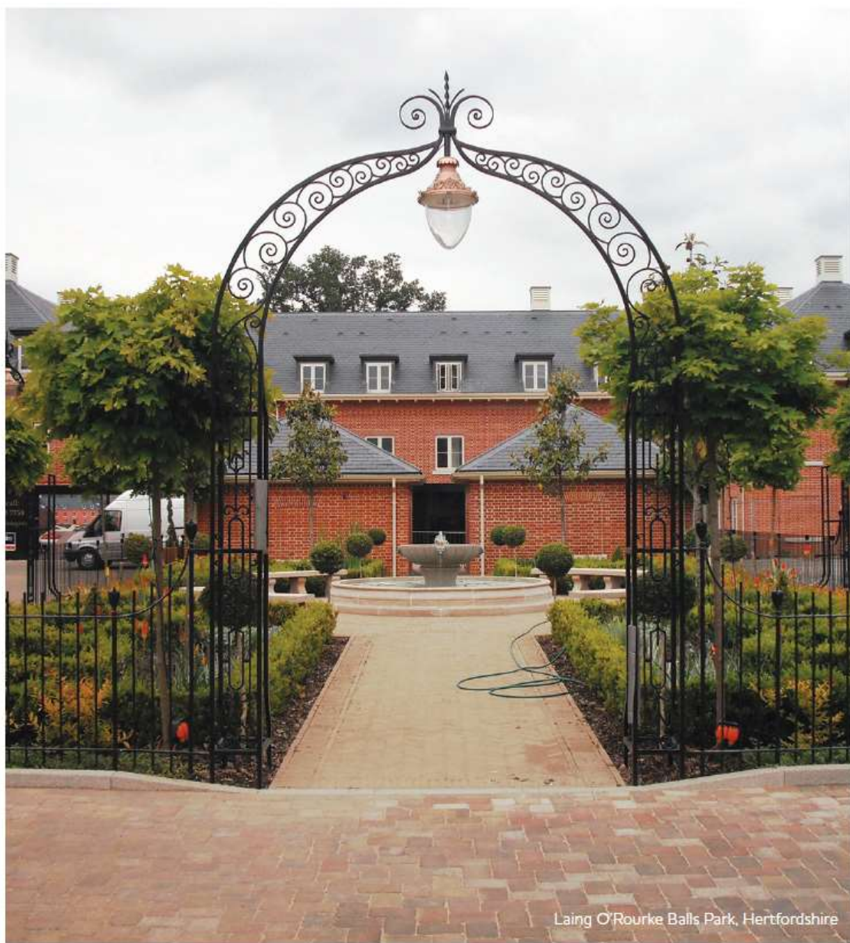
Laing O'Rourke Balls Park, Hertfordshire