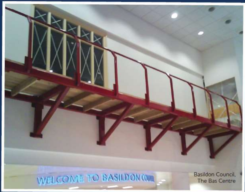
Basildon Council, The Bas Centre