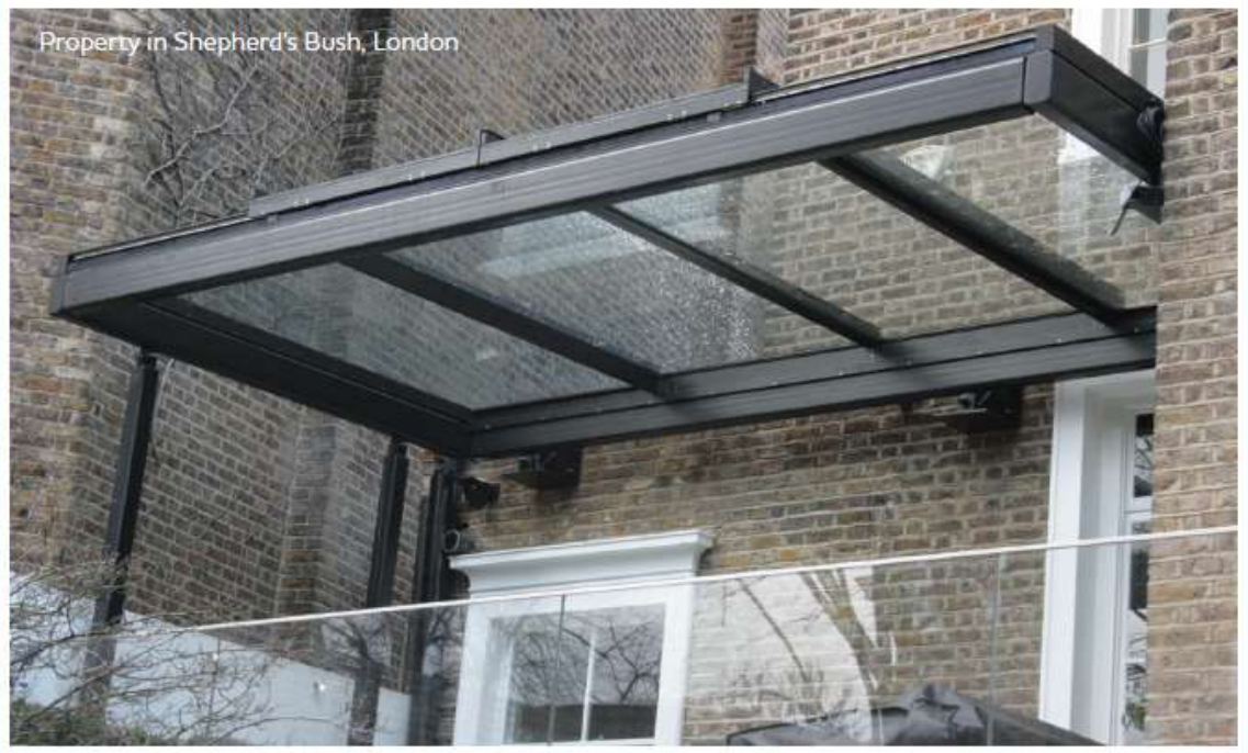
Property in Shepherd's Bush, London