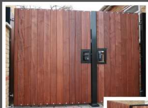
Seymour Hall, Chelmsford