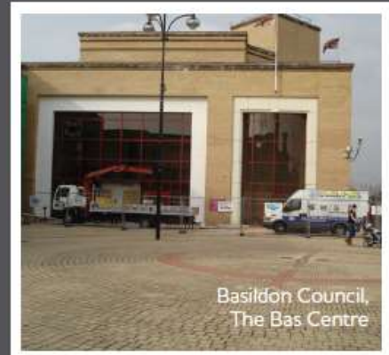
Basildon Council, The Bas Centre