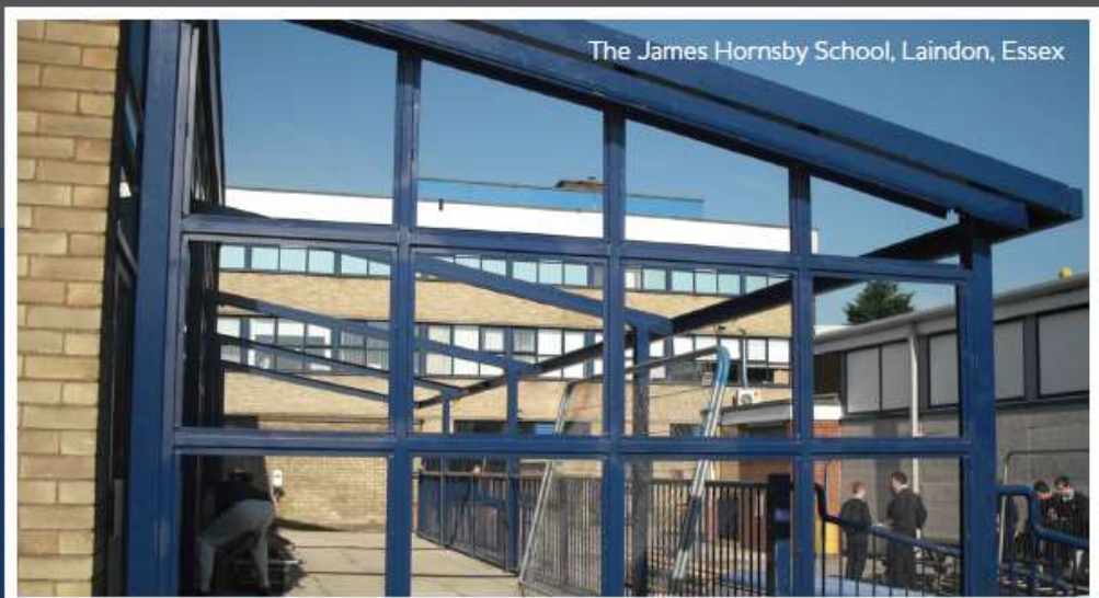
The James Hornsby School, Laindon, Essex