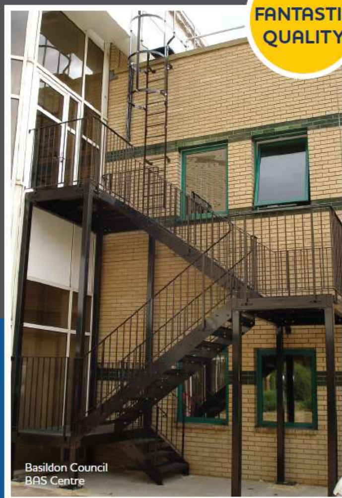
Basildon Council BAS Centre